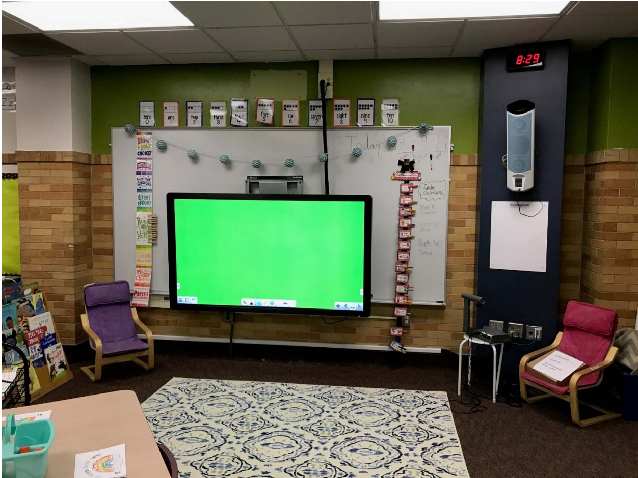
Quarton - Room 107 – Visual Display in lowered position for student interaction