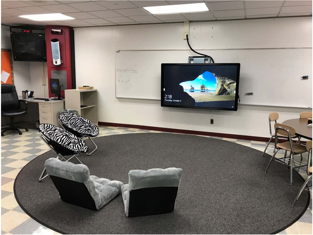
West Maple – Room 46 Visual Display Installation