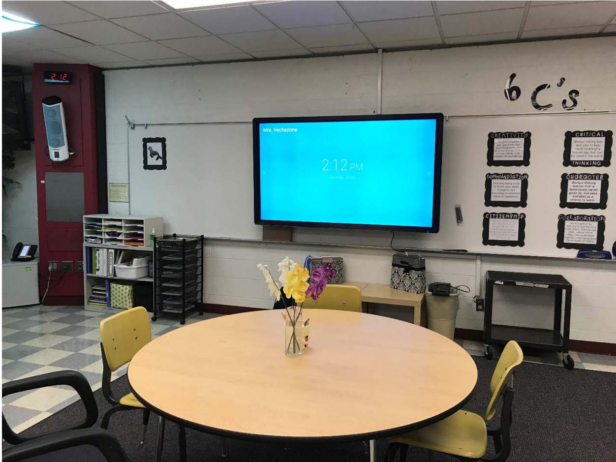
West Maple – Room 5 Visual Display Installation