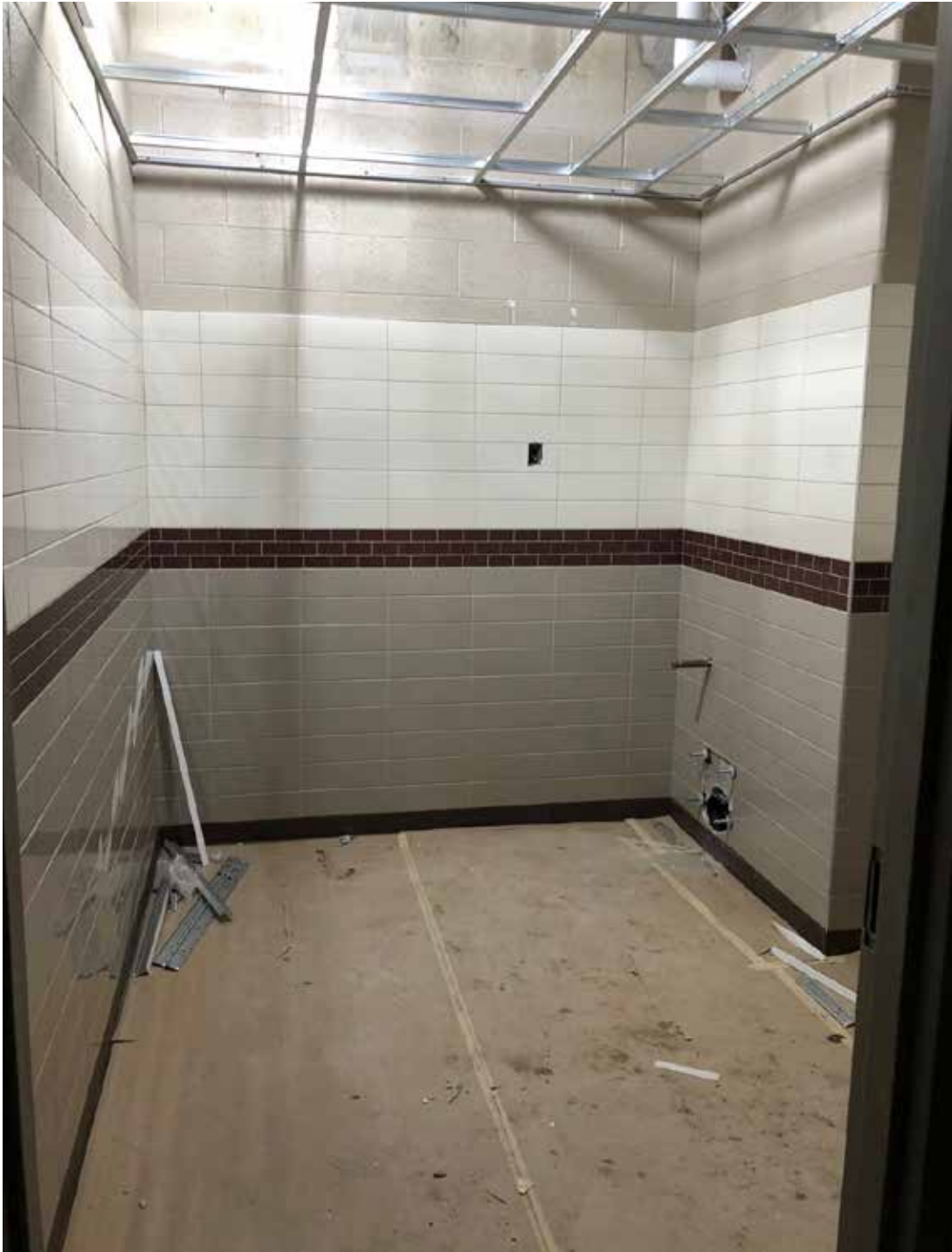
New Restrooms in Dressing Room