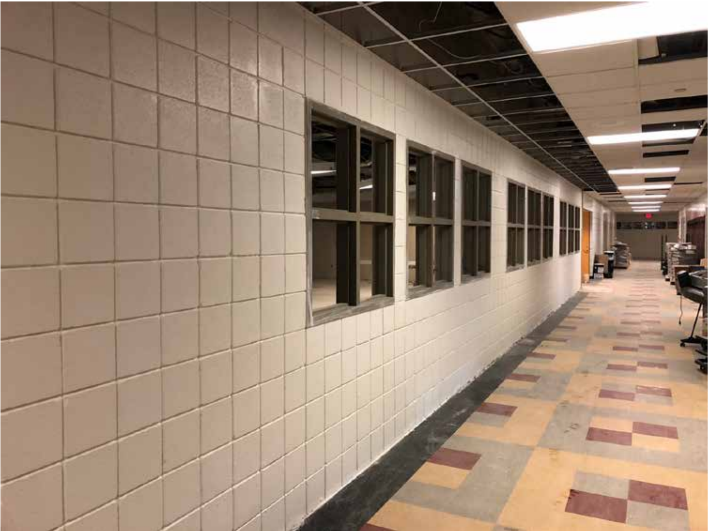
New Corridor Wall Outside Robotics