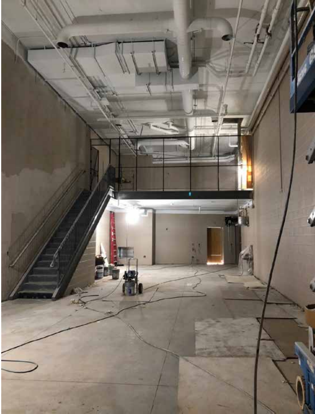
Scene Shop Addition