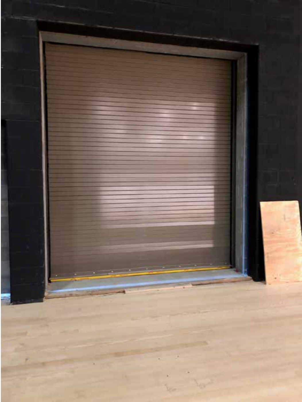
New Rolling Doors between Scene Shop and Auditorium