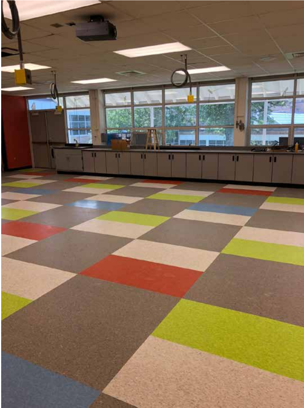
Floor Installation – Maker's Space Room