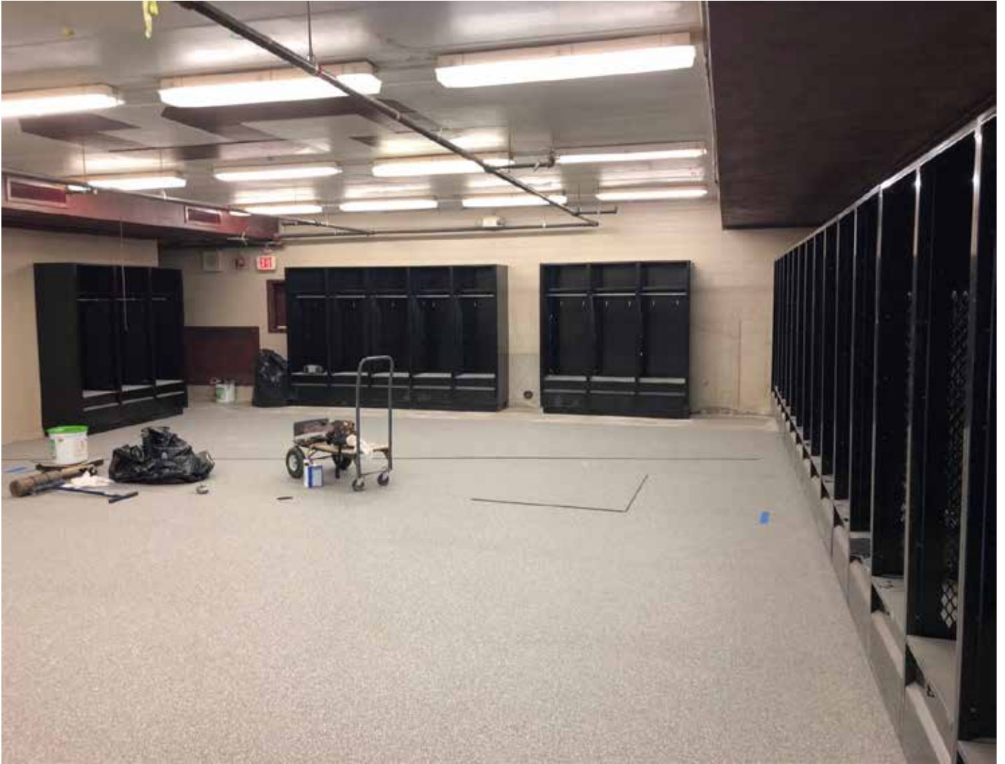
Team Room Locker and Rubber Floor Installation