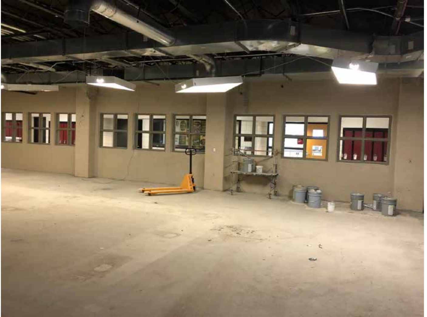
New Windows Outside Robotics' Room