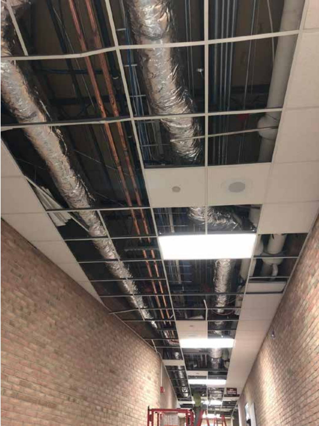
Overhead Mechanical Ductwork and Piping