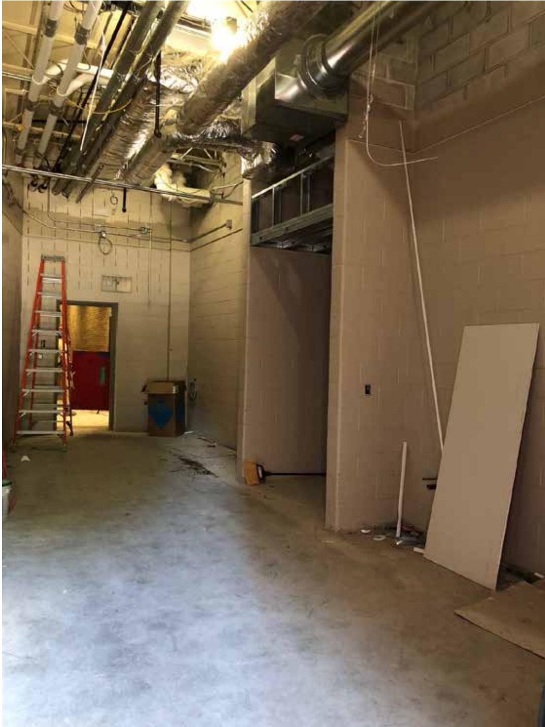
Dressing Room Entrance