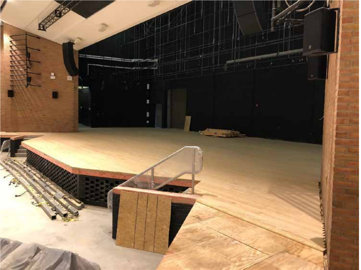
Auditorium Stage Floor