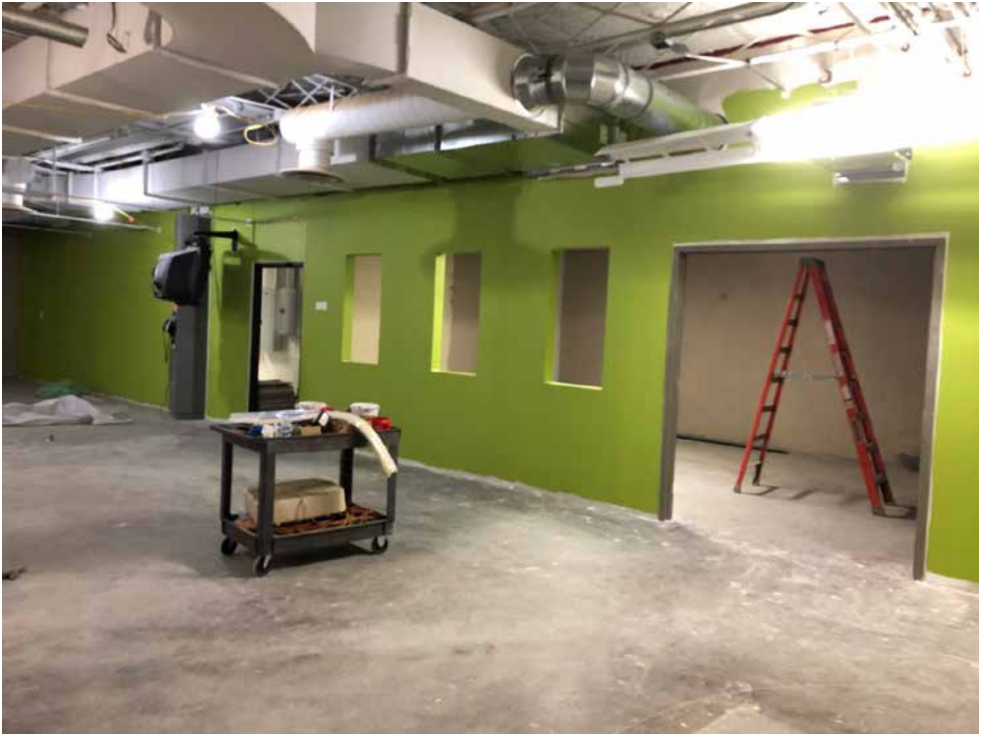
New Woodworking Room