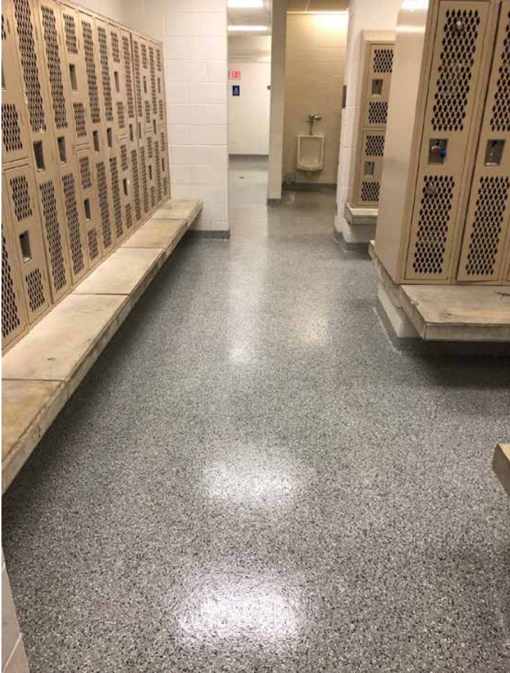
Epoxy Floors in Girls/Boys Locker Rooms